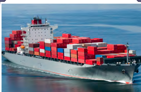
Container ship transporting goods