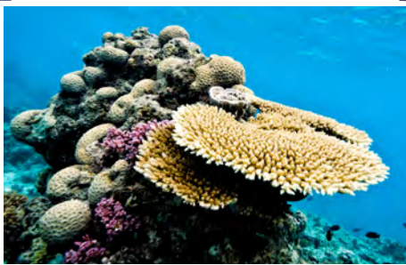
Great Barrier Reef coral